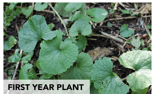
FIRST YEAR PLANT