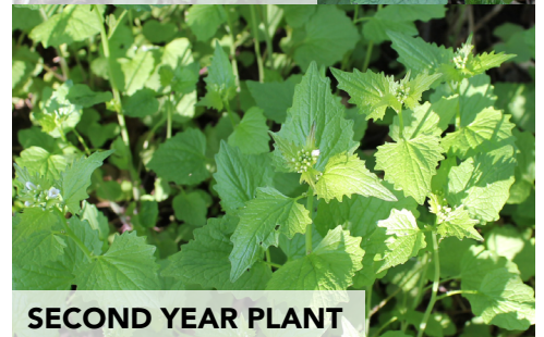
SECOND YEAR PLANT