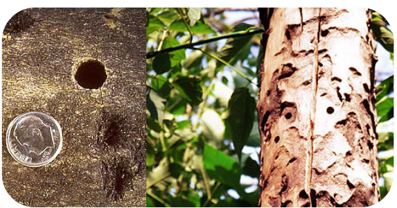
Be alert for large, round exit holes (15-20 mm in diameter) made by emerging adult ALHB.

Top: Invasive Asian longhorned beetle Bottom: Native white spotted sawyer beetle