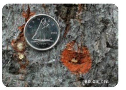
Look for shallow pits or depressions chewed in the bark. Females deposit singly in these pits, laying about 90 eggs over the course of a season.