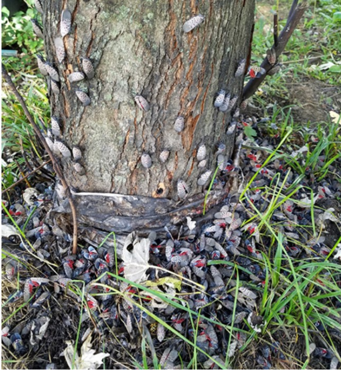
Figure 3. Live and dead adult SLF on the ground.

While surveying a grid point, if Tree-of-Heaven ( Ailanthus altissima ) is present, record this observation in iNaturalist . This data will assist in determining where to survey for SLF. Examine Tree-of-Heaven for SLF but only examine those within the radius of that particular ALHB grid point; you don't have to examine all Tree-of-Heaven within 200m of the grid point, just those while conducting the ALHB survey.