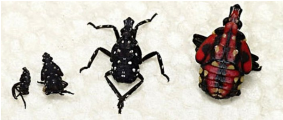
Figure 1. The four nymphal instars of SLF.

Suspect egg masses can be removed by prying a pocket knife under it.